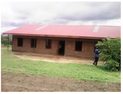
Wato classroom block

Mostly these projects are community driven and the challenge sometimes is to ensure that the builders they engage will do a good and honest job. As a MACS' Representative I often have to remind the committee and their builder to adhere to our high standards.