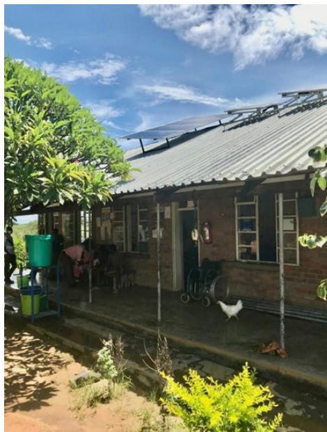
New panels on the roof of Chididi Health Centre