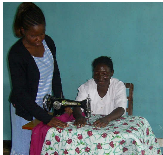
Learning a valuable skill

The courses run for six months and include theoretical and practical skills covering clothing and textiles, agriculture, food security, tailoring and fashion design, nutrition, health and sanitation, housing and home management, community development, human behaviour, spiritual development, business communication and management, and professional English.