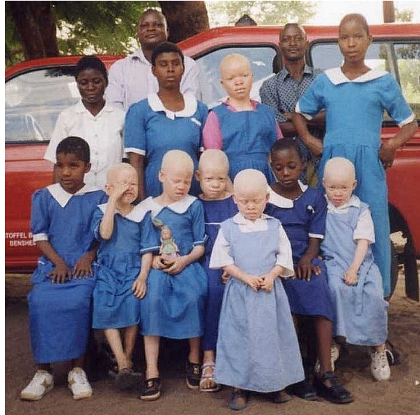
Girls at Nkope Unit for blind and partially sighted children