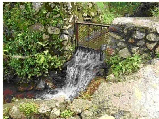
Likwenu River water supply

The executors of a generous legacy looked at a number of charities to which to donate and decided that MACS should be the main recipient because of its low overheads and local monitoring of projects. As a result MACS is funding a second hostel for girls at Malosa Secondary School; a new laboratory for St Luke's Hospital; and a significant project to upgrade the water supply to over 4,000