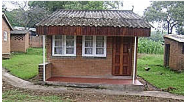
A refurbished chalet

MACS has helped fund improvements to five small houses by adding en-suite facilities, improving the water heating system and a kitchen, thus making self-catering chalets, which Chilema says will minimise the problem of accommodation. Further houses are being upgraded. MACS has also contributed to the building of a brick wall to protect the Community Homecraft area and garden.